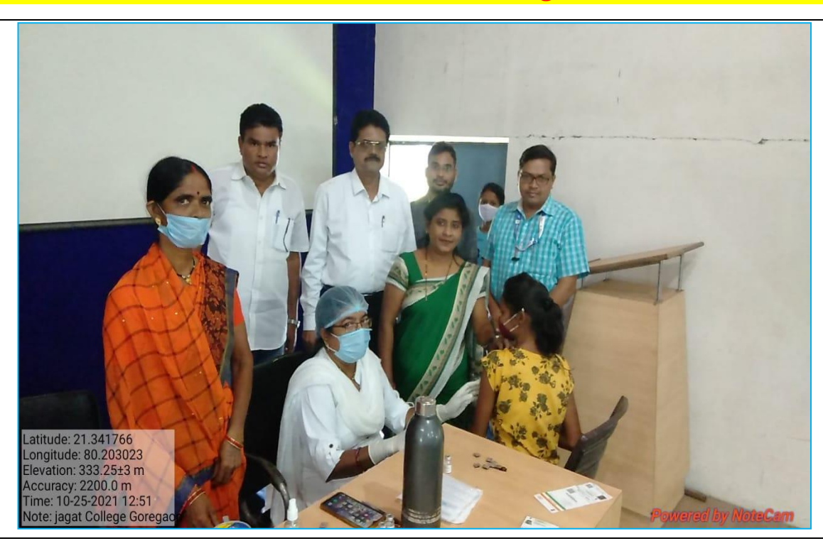
Covid-19 Vaccination Camp was organized on 25th October 2021