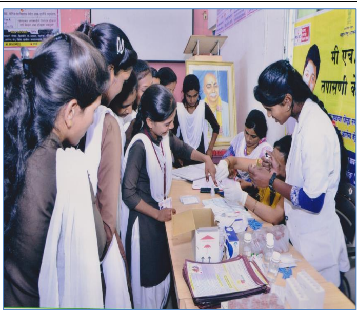
Students are undergoing for health check-up on 1<sup>1th</sup> December 2017.