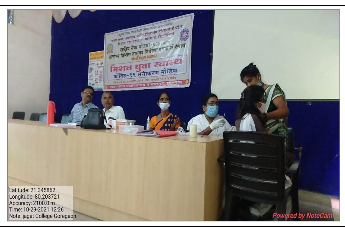
Covid-19 Vaccination Camp was organized on 29th October 2021