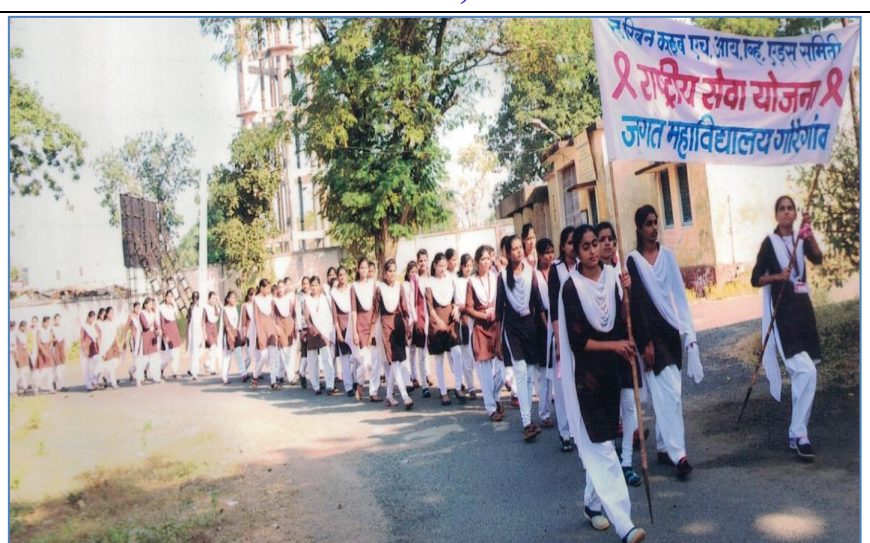
NSS Volunteers in AIDS awarness march on 1st December, 2017