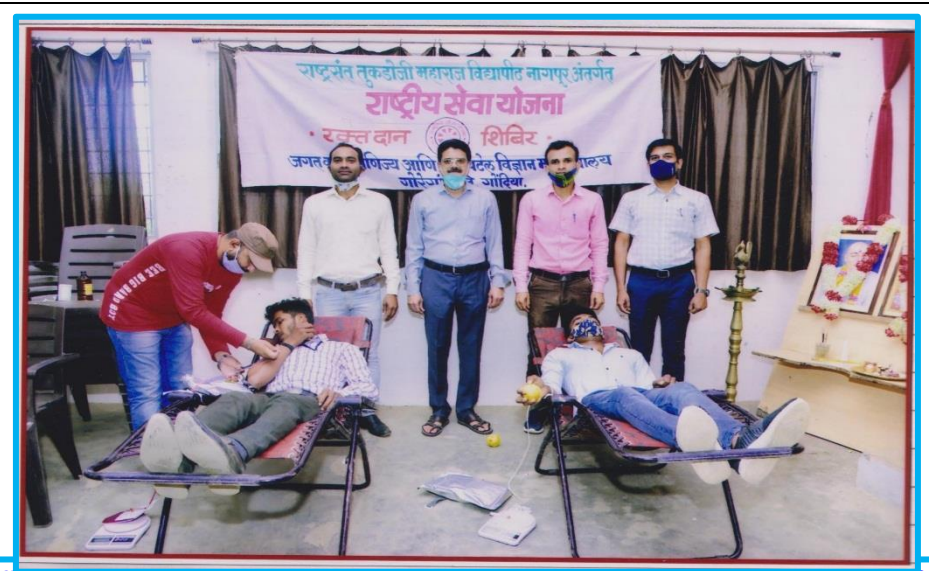
Student donating blood in the presence of pathologist on 26" March 2021