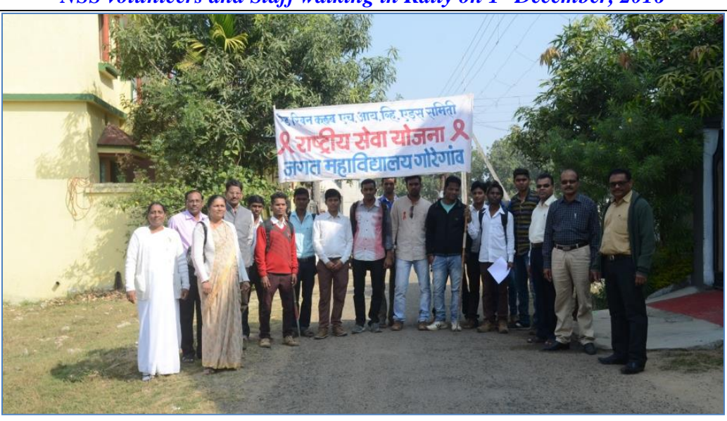
NSS volunteers and Staff walking in Rally on 1st December, 2016